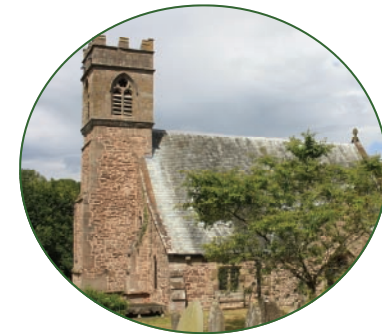
Church of St Michael and All Angels